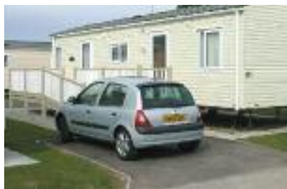
Ramp access and parking