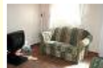
A Typical Chalet