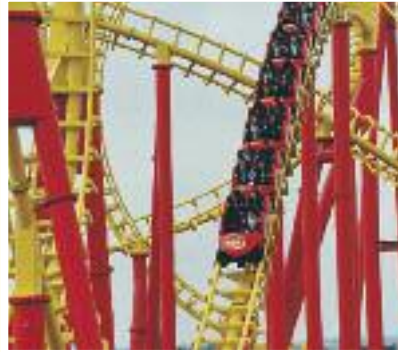
The Millennium Rollercoaster Fantasy Island

Skegness and the local area generally provide an array of entertainment for all. The town has theatre, cabarets, superb bowling greens and gardens, bingo, amusement arcades, theme parks, eateries, as well as a healthy selection of pubs and clubs and miles of golden sands.