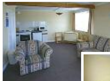
Elmhirst Lounge & Family Bedroom

Elmhirst and Shakespeare Flats provide basic accommodation for a budget holiday, for up to 6 family members.