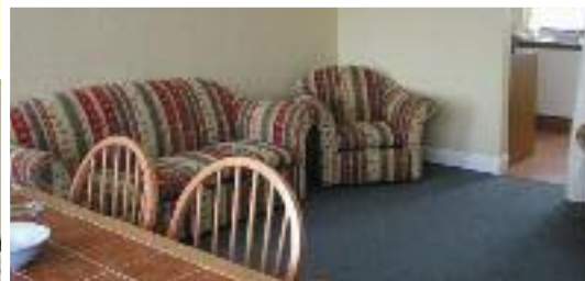
Tennyson Holiday Apartment

Elmhirst and Shakespeare Flats provide basic accommodation for a budget holiday, for up to 6 family members.