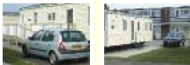
Parking By Caravans