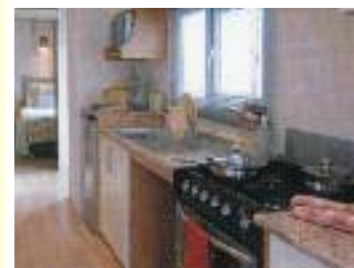
Sovereign caravan kitchen